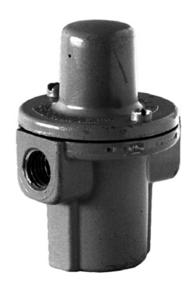
Figure 1. Type H800 Relief Valve

The Type H800 relief valve<sup>(1)</sup> (See Figure 1) is a compact, Direct-Operated relief valve. It is used primarily between a pneumatic instrument and its supply pressure regulator to limit the instrument supply pressure to 50 psig (3,4 bar) should the supply pressure regulator fail open. The Type H800 relief valve can also be mounted on other equipment, such as an air compressor, where limited relief capacity is desired.